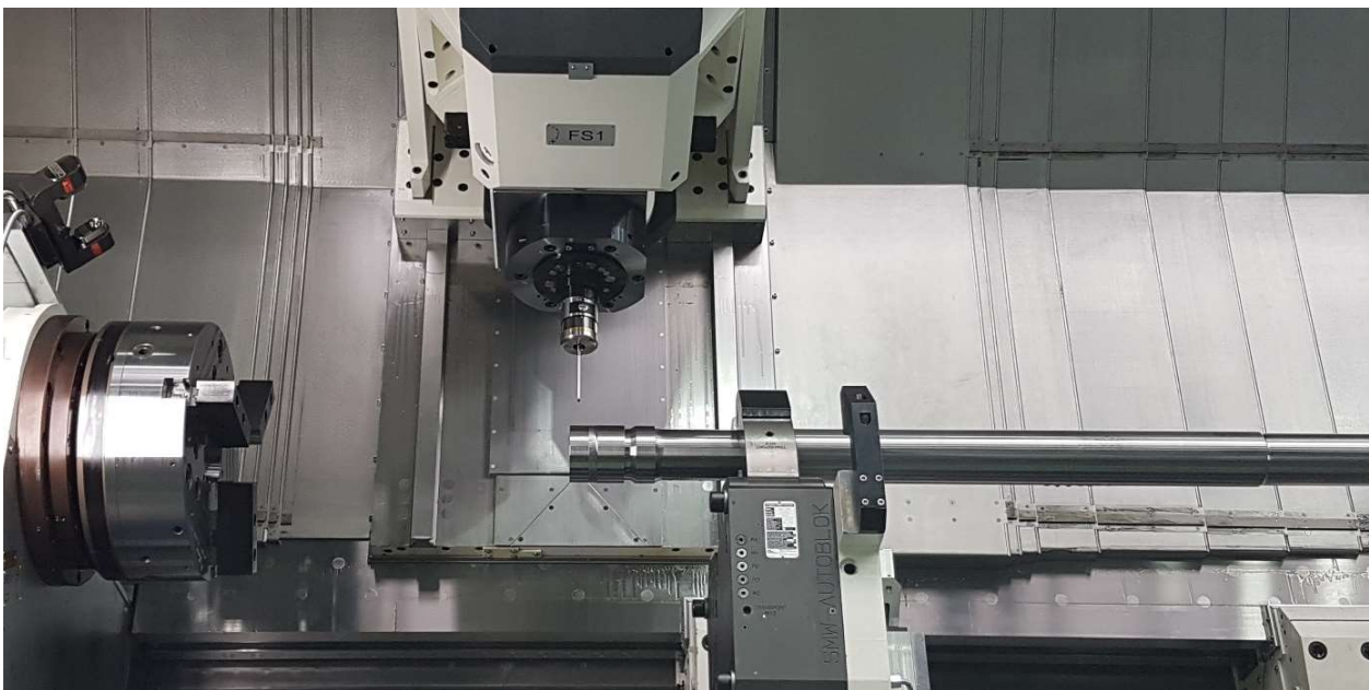
Image 1 - Complete Machining of Turbine Shafts without Operator Intervention