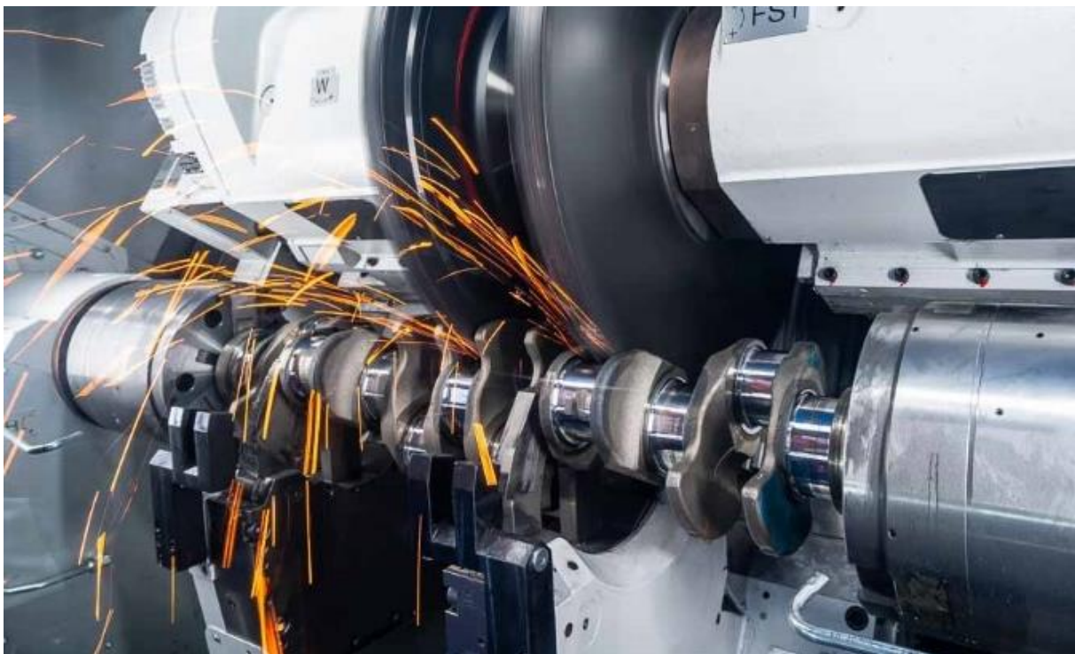
Image 1 - Hard milling of a 6-cylinder crankshaft for trucks