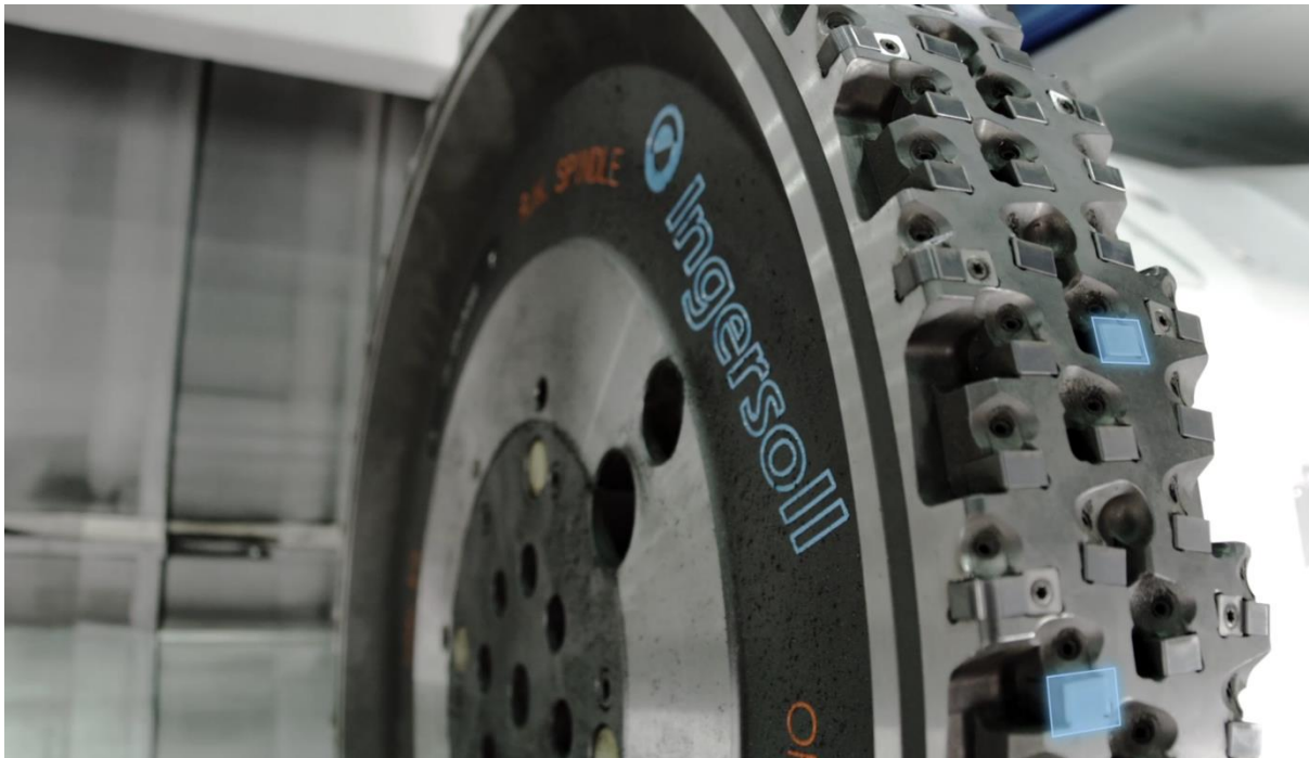
Image 4 – Milling tools with specific ceramic cutting inserts of the company 'Ingersoll Werkzeuge GmbH'